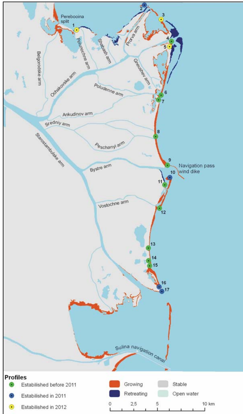
Fig. 1 – Skeleton map of location of profiles and eco testing grounds at the marine edge of the Kilia Danube Delta.

In 2011–2012, the marine edge retreated there as far as 18 m. The sand, accumulated near the left side of the dyke is loose and forms sand dunes. When the north wind blows the dunes move, partially run over the dyke and fall into the canal. To all appearances, this process will soon stop, due to fixation of the sand spit and dyke by delta vegetation. Generally, this area, under increasing deficit of sediments, will stabilize or even be eroded.