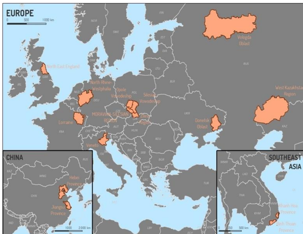
Fig. 2 – Co-operation partners of Moravia-Silesia (Source: author's elaboration).

The table and a figure below clearly shows that the Moravian-Silesia Region ignores more or less co-operation with African and Latin American partners, co-operation with the USA – is limited to the co-organisation of the NATO days.