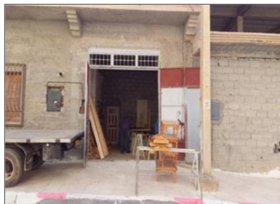
Figs. 2, 3 – Car washing and lubrication facility and wood carpentry facility, two class III classified establishments licensed by the Municipal People's Council (Saci, Young 2019).