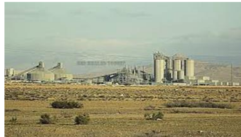
Figs. 5, 6 – The first-class cement factory is licensed by the ministry located in the city of M'sila, threatening health and the environment because of its proximity to some urban communities, which affects the health of the population (Saci, Young 2019).