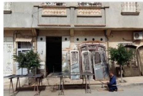
Figs. 7, 8 – The 7 th figure represents the mechanical repair shop for vehicles under municipal license of the third class, and the 8 th figure represents a technical blacksmith facility subject to a country's third category license; the two facilities pose a threat to the urban environment (Saci, Young, 2019).

The classification of this workshop is based on the energy and size of electrical machinery, and the greater the area and volume of electrical power of the machines within the classified establishments, the more the classification changes according to the degree of risk to the population, to property, and to the Environment.