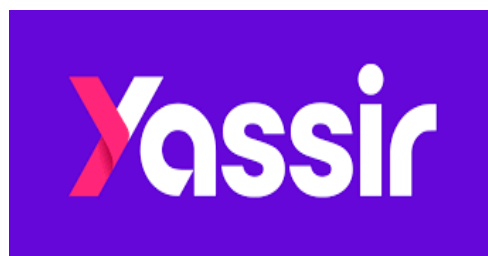
Fig. 3 – Yassir app logo.